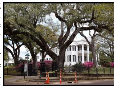
Antebellum home in Natches