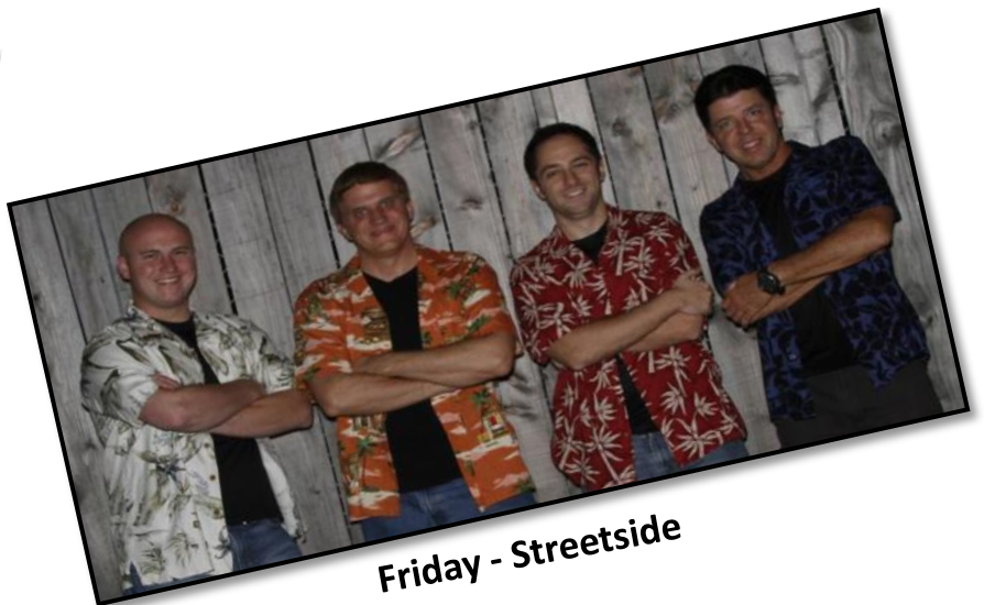
Friday - Streetside