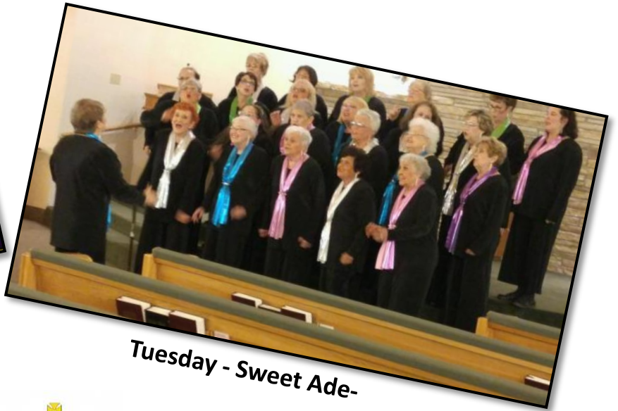
Tuesday - Sweet Ade-