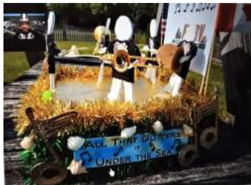
FCRV Band Playing Theme Song – Snodgrass Family, OH