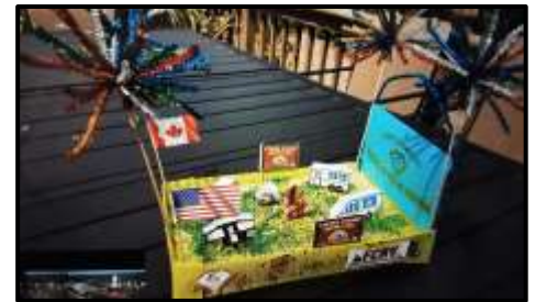
Nothing Can Stop Our Celebration – Marilyn Rausch * First Place