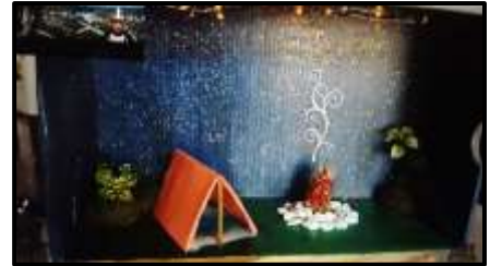
Night Time Glitter—Cathy Colier, NY