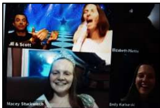
The Gallery gets into TikTok