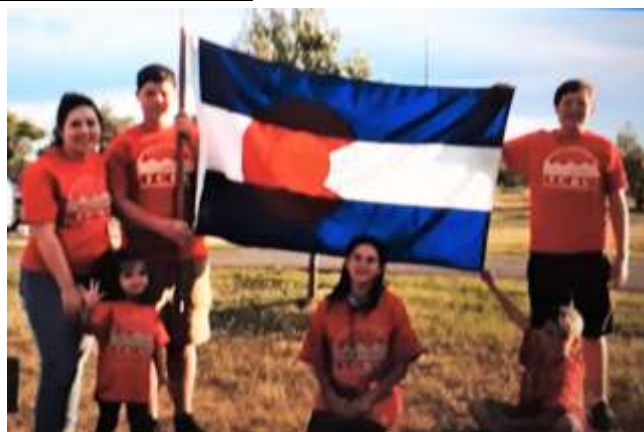
Colorado Flag presented by the Kendle Family