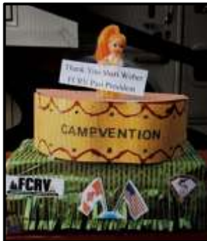
Girl In A Cake - Craig Weber