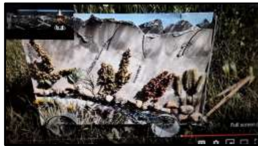
Rocky Mountain High – RV Rascals, CO