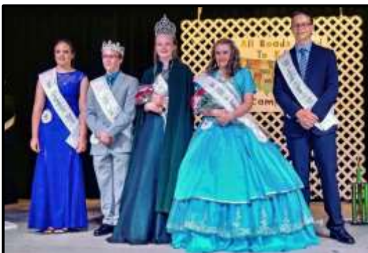
2019-2020 Teen Royalty