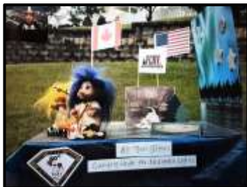
All That Glitters Under The Northern Lights Jill & Scott Serbousek