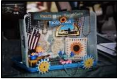
Families Glitter With Camping Fun – Sun Flower Ramblers, KS