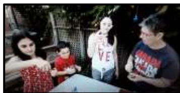
Garden Gazing Ball Craft

Youth also were welcome at some of the Campvention craft projects.