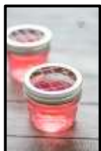
Gel Air Freshner