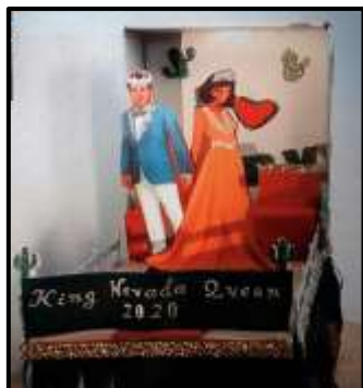
Nevada 2020 – Cactus Bandits Chapter